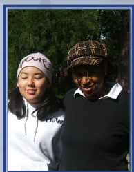
Some volunteers who served at the Australian National Bahá'í Centre

If you are interested to apply for service as a volunteer at the Australian National Bahá'í Centre, application forms are available from: