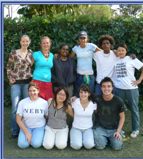
A group of volunteers who served at the Australian National Bahá'í Centre