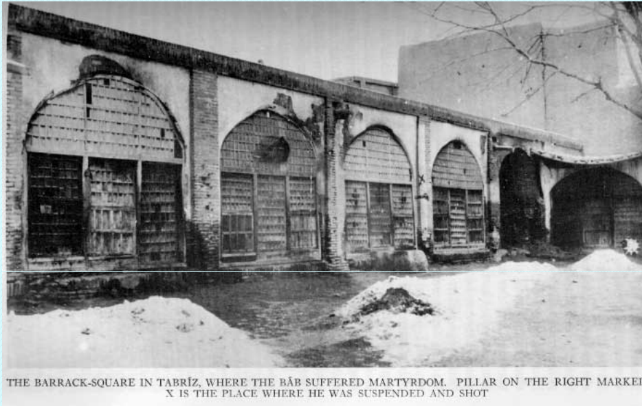
THE BARRACK-SQUARE IN TABRÍZ, WHERE THE BĀB SUFFERED MARTYRDOM. PILLAR ON THE RIGHT MARKED X IS THE PLACE WHERE HE WAS SUSPENDED AND SHOT

His followers were persecuted and large numbers were put to death.