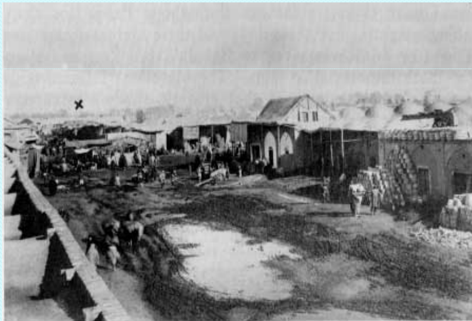
SOUTHERN PART OF TIHRÁN WHERE CRIMINALS WERE HANGED AND WHERE MANY BAHÁ'Í MARTYRDOMS TOOK PLACE (MARK X INDICATES SITE OF THE SÍYĀH-CHĀL)

Baha'u'llah's sufferings began the moment He arose to proclaim the Cause of God – He lived a life of exile, imprisonment and persecution; He was put in chains in a dark and dismal dungeon in Tihran.